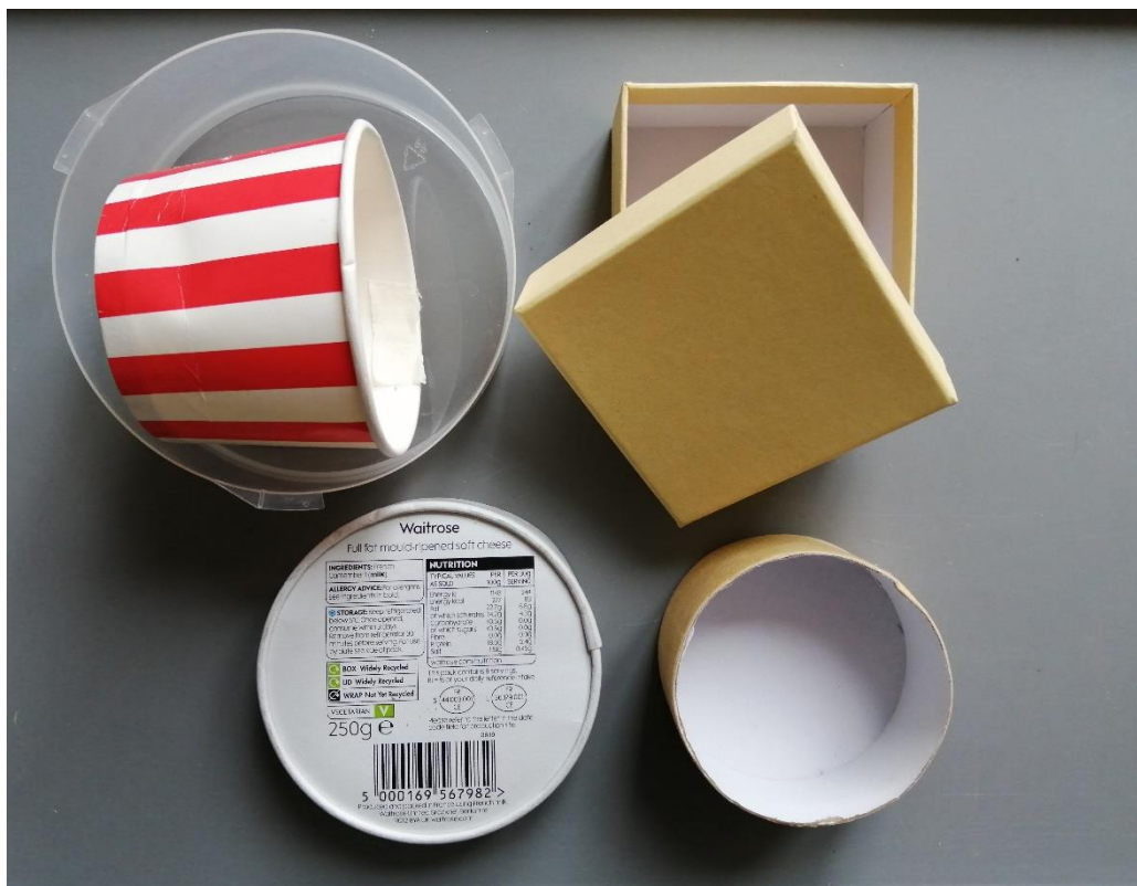
Card craft boxes, clean card and plastic food packaging.