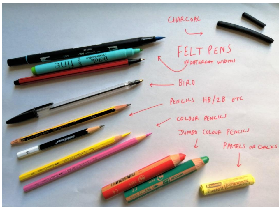
Selection of drawing and colouring materials including felt pens, fine line pens, biro pens, pencils (different grades if you have them), pencil crayons, pastels, chalks, and charcoal.