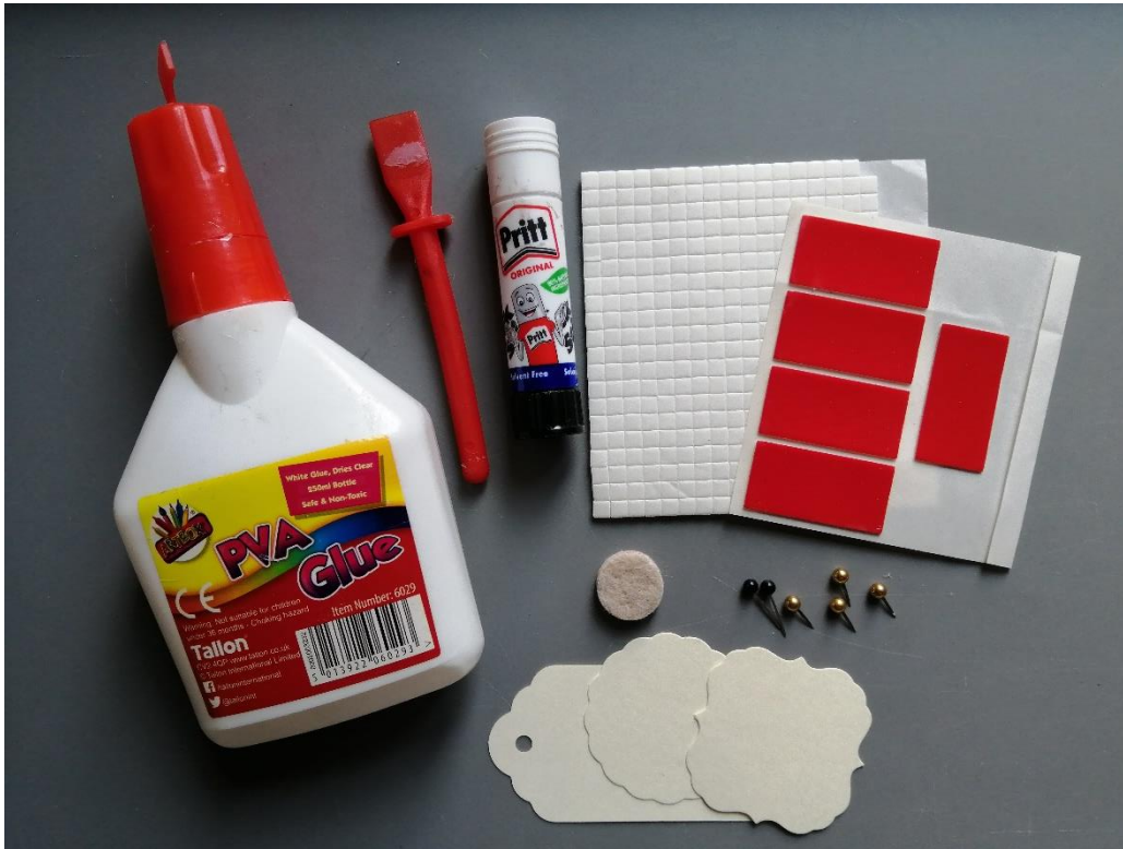
PVA glue, glue stick, glue spreader, sticky foam crafting squares, felt pads, map pins and fancy paper labels.