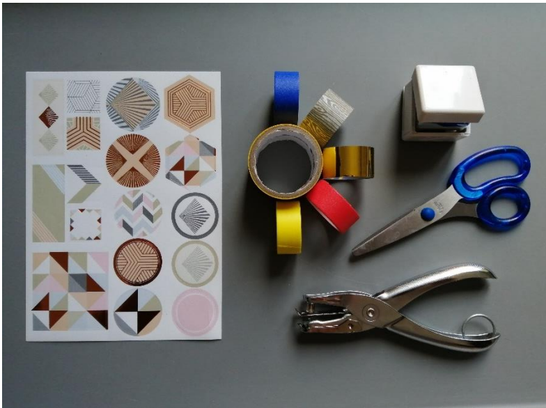
Washi, electrical and foil tapes, stickers, square punch, round hole punch, scissors.